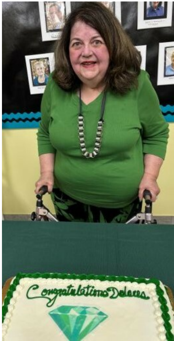
St. Pat's & Potluck