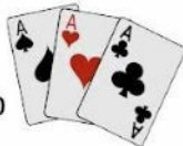
Table Fees per Session

Friday, Saturday & Sunday: $15 ($4 more for lapsed members)