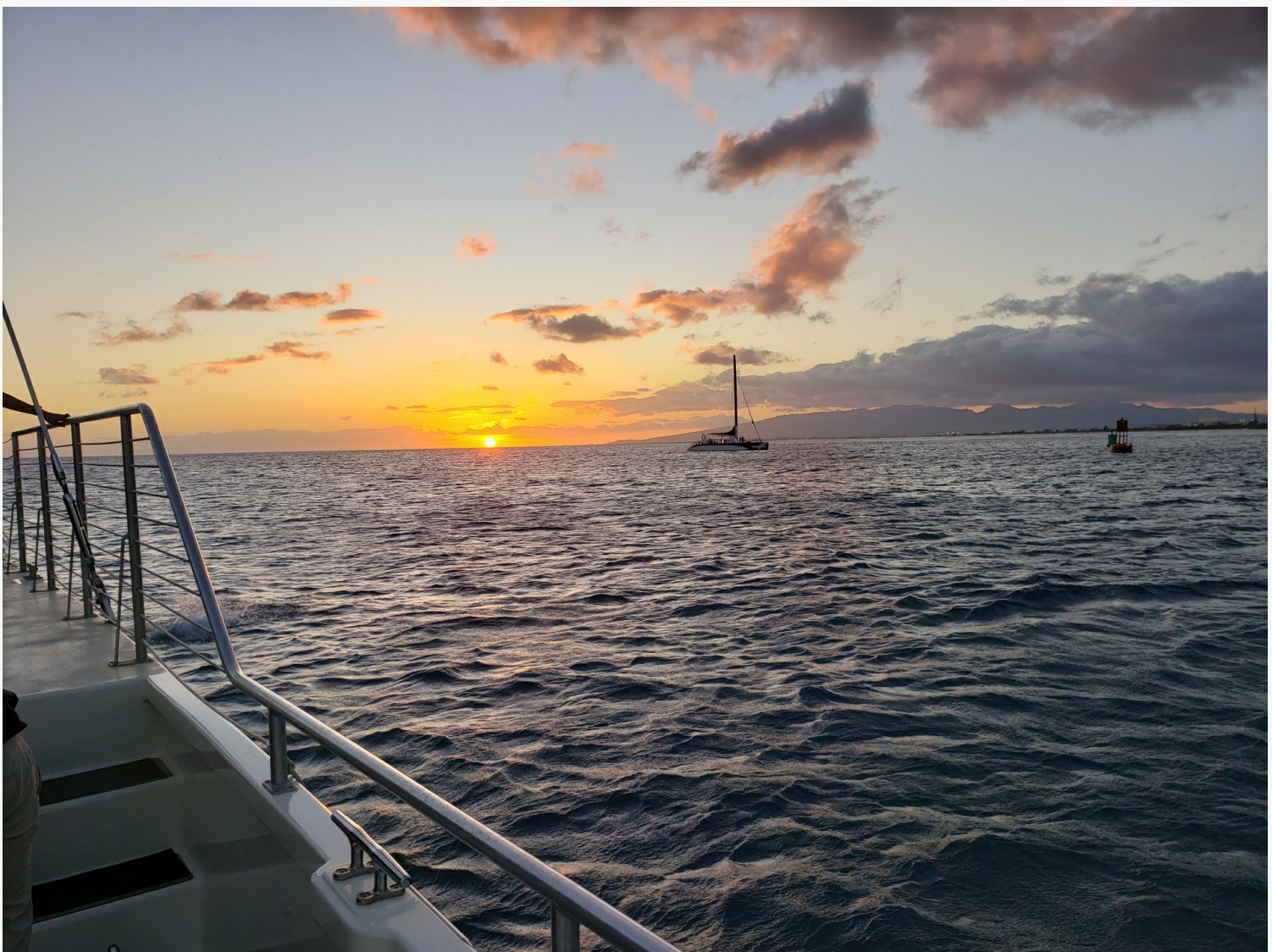
On the water in Oahu