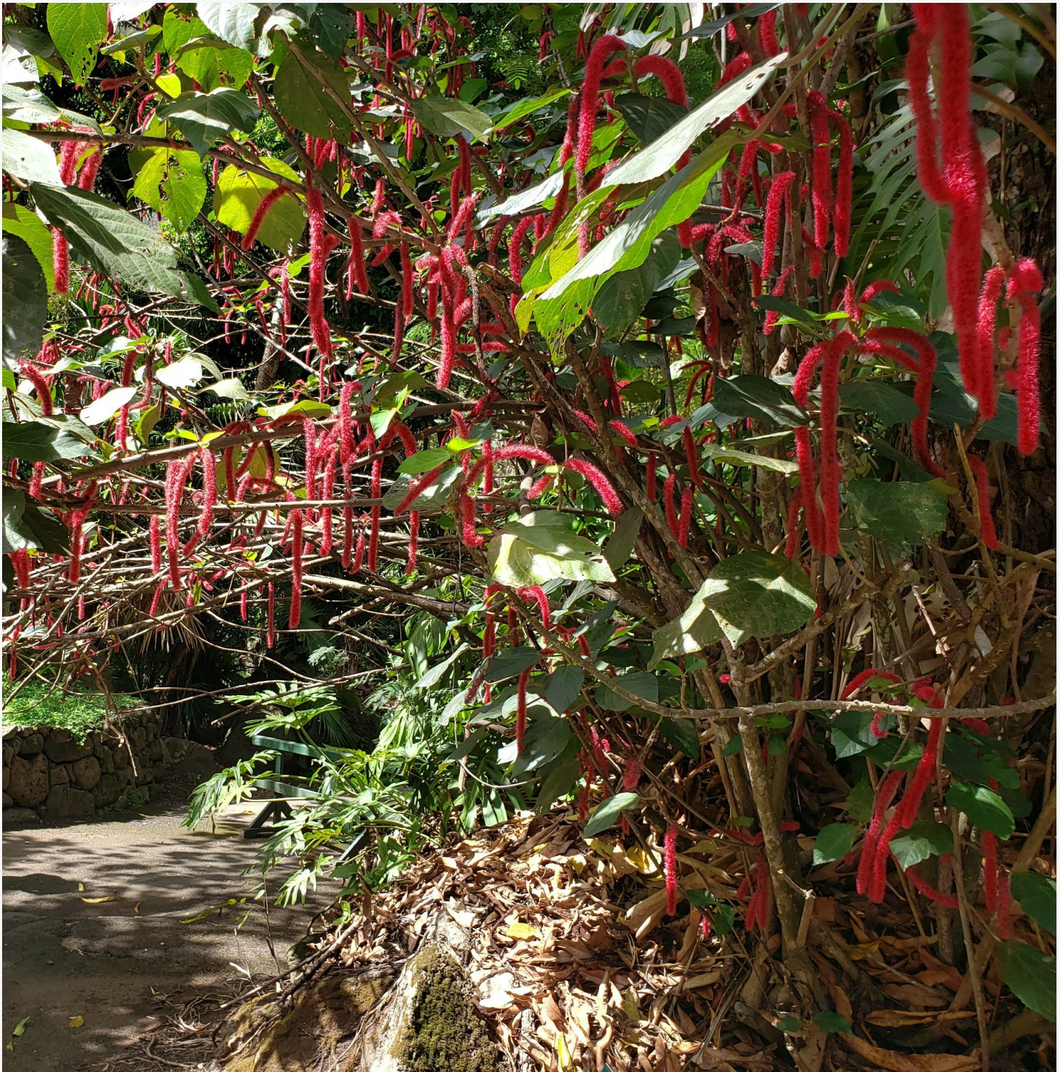
Plumeria in Oahu