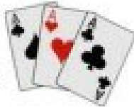
Table Fees per Session

Thur, Fri & Sat: $12 ($4 more for lapsed members)