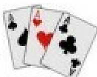
Table Fees per Session

Thur, Fri & Sat: $12 ($4 more for lapsed members)